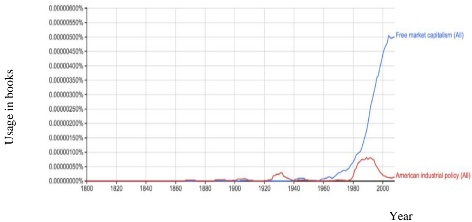
Figure 7. Ngram of ‘Free market capitalism’ and ‘American industrial policy’

During the years 1990-2010, we observe a negative correlation between the terms “free market capitalism” and “American industrial policy” (figure 7).