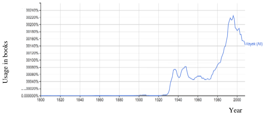
Figure 4. Ngram of ‘Hayek’

In the following charts (figures 4 – 7), we track the usage of select words and phrases pertaining to free markets, neoliberalism, and industrial policy. Figure 4 confirms the increased interest—particularly after 1980—in one of the theoretical pioneers of free market capitalism, Friedrich A. Hayek.