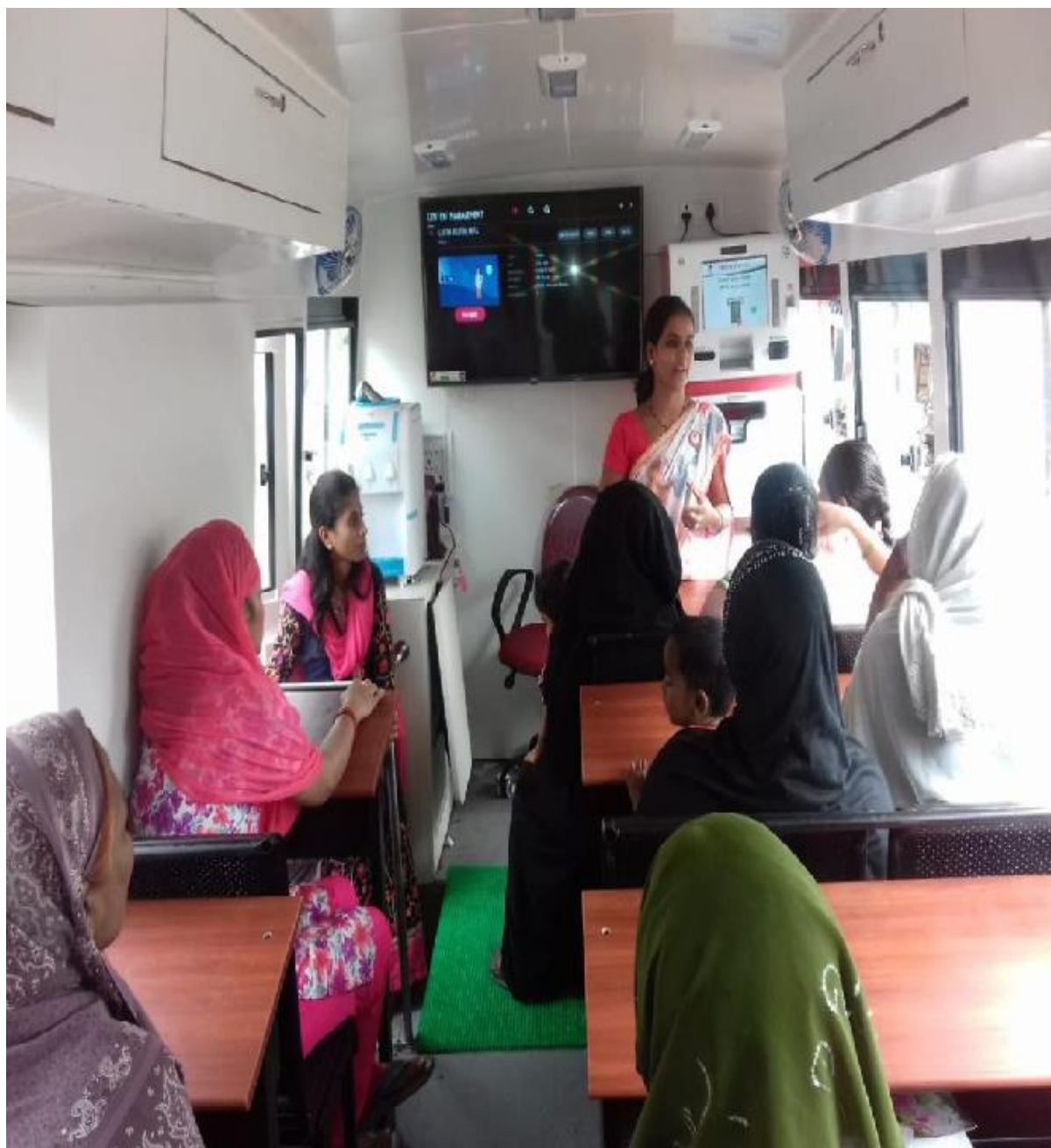
The Financial Literacy Bus of the Mann Deshi Foundation.

The curriculum covers diverse aspects of the financial and digital worlds. Women entrepreneurs are introduced to the benefits of cashless transactions and the larger objective is to connect them to bigger markets, create cash flow records, and generally make business payments easier for these rural women entrepreneurs. (Wheels-of-change, Mann Deshi Foundation, 2018)