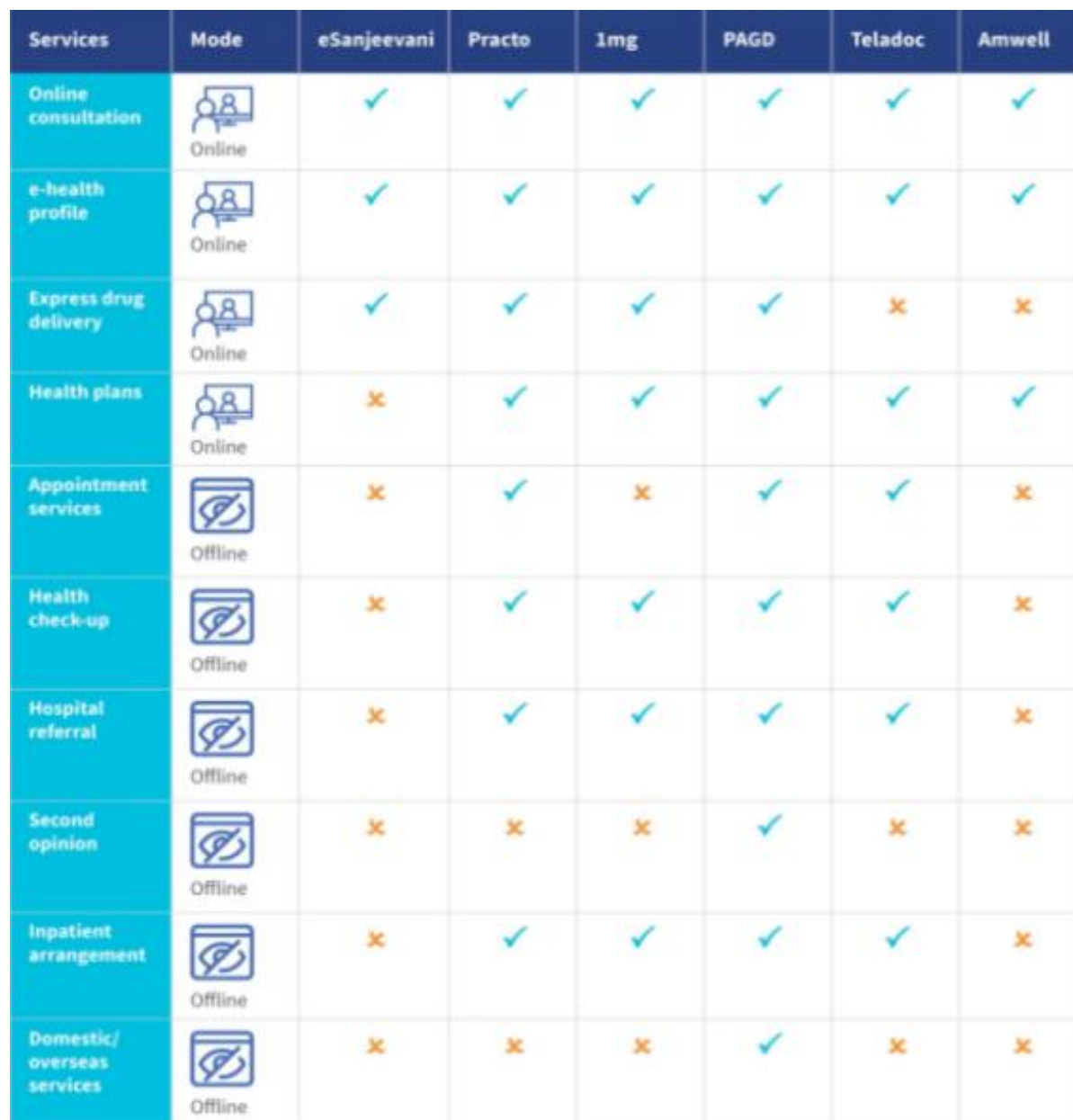
Figure 3: Comparison of eSanjeevani OPD with Global telemedicine Platforms

Source: Khanduja, Puneet, Venkat Goli, and Suhird Singh. 2021. "Reimagining the Indian Government's Telemedicine Platform." 2021.