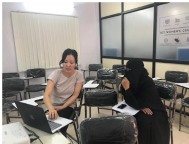
Training of ICT Center staff

Having learned that the baseline of the students was significantly lower than expected in computer usage, as well as a relatively short period to learn competencies (3 months), the program contents has been redefined to target key areas identified along with DC's Center visit and to match the realistic pace of the classes. The sample Week 1 curriculum content plan below reflects the latest draft reflecting the adjustment that needed to be made to accommodate time constraints, students' availability and competency levels.