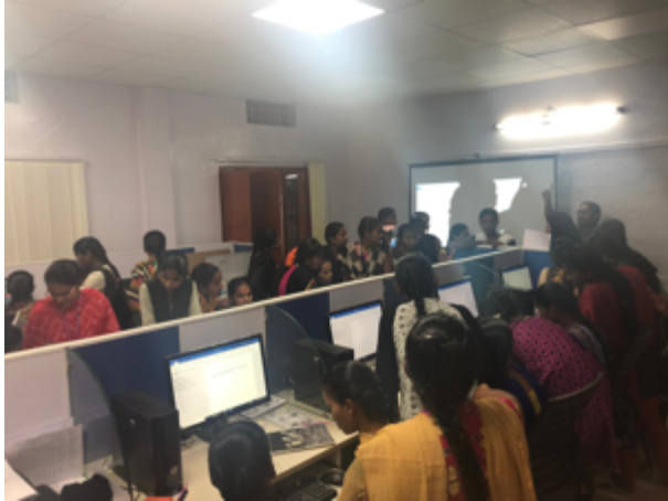
Additional class offered with activities