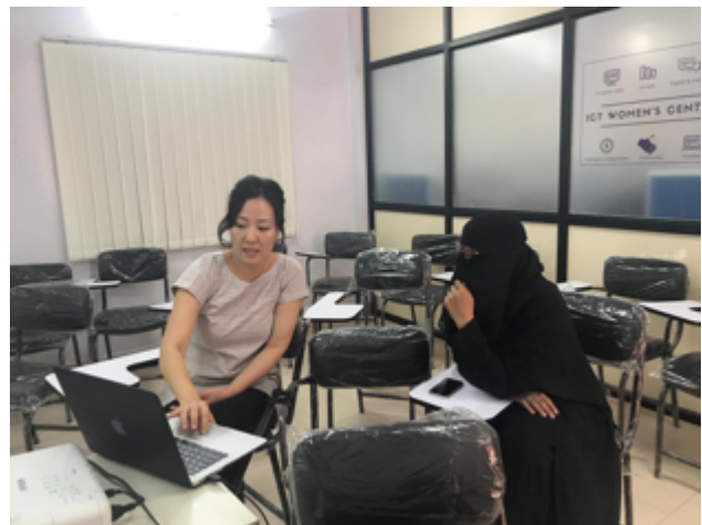
Training of ICT Center staff

Having learned that the baseline of the students was significantly lower than expected in computer usage, as well as a relatively short period to learn competencies (3 months), the program contents has been redefined to target key areas identified along with DC's Center visit and to match the realistic pace of the classes. The sample Week 1 curriculum content plan below reflects the latest draft reflecting the adjustment that needed to be made to accommodate time constraints, students' availability and competency levels.