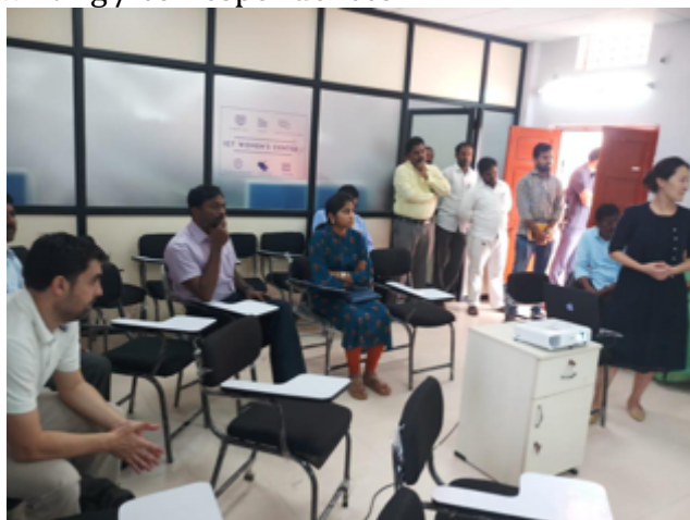
DC's visit to the Center and meeting

During the site visit along with the opening of the ICT Center, feedback from the DC further directed adjustments in curriculum to target specific key content areas. The main feedback was the need for curriculum contents to enable various skill sets for a targeted need in the local job market for handling customer complaints or effectively utilizing ICT skills for business promotion. There is also a need to train in combining various competency areas to effectively communicate a message, whether by social media or presentations or letter writing / correspondences.