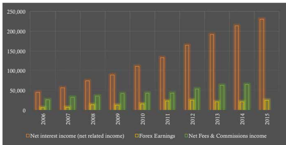
Figure 3: Income Structure (2006-2015, Millions of KShs.)

Source: ThinkBusiness, Banking Survey 2016