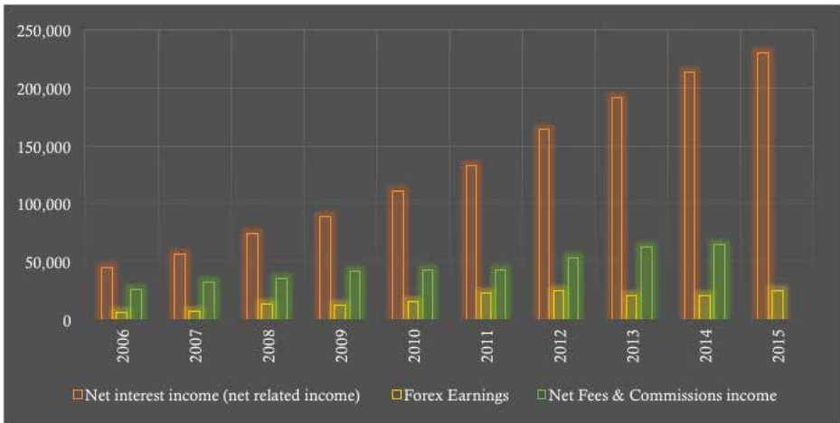
Figure 3: Income Structure (2006-2015, Millions of KShs.)

Source: ThinkBusiness, Banking Survey 2016