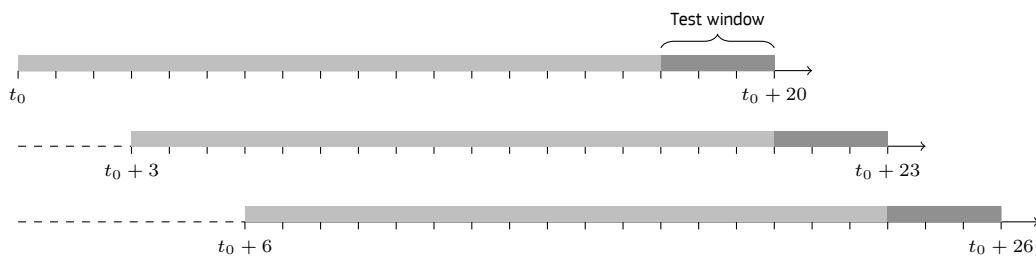
Figure 3: Event-study with rolling windows

Finally, we pool together the results and test whether the significant increases detected are correlated with Governments' announcements. In particular, we focus on two broad sets of measures: fiscal stimuli for the whole economy and support to households either in the form of income support or debt relief. We estimate a linear probability model in which the dependent variable is a dummy which takes value one if a significant increase is detected at time t in country c , and zero otherwise. The set of covariates includes a dummy identifying the week of announcement of the lock-down; a dummy for the week of announcement of any fiscal stimuli; and one for the week in which income support and debt relief measures are first announced. We also include country and time fixed effect. Results are presented in Table 1. The four columns are relative to different definitions of the time and test windows.