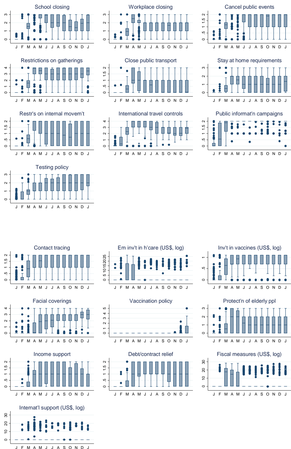
Figure 3: Government Response Measures to Covid-19

Notes: Data are monthly averages of daily values, January 2020 – January 2021. Raw data (last update: March 24, 2021) taken from the Oxford Covid-19 Government Response Tracker (OxCGRT).