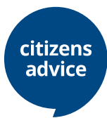
Figure B.1: Example of a letter used for the encouragement using the Citizens Advice logo (front).