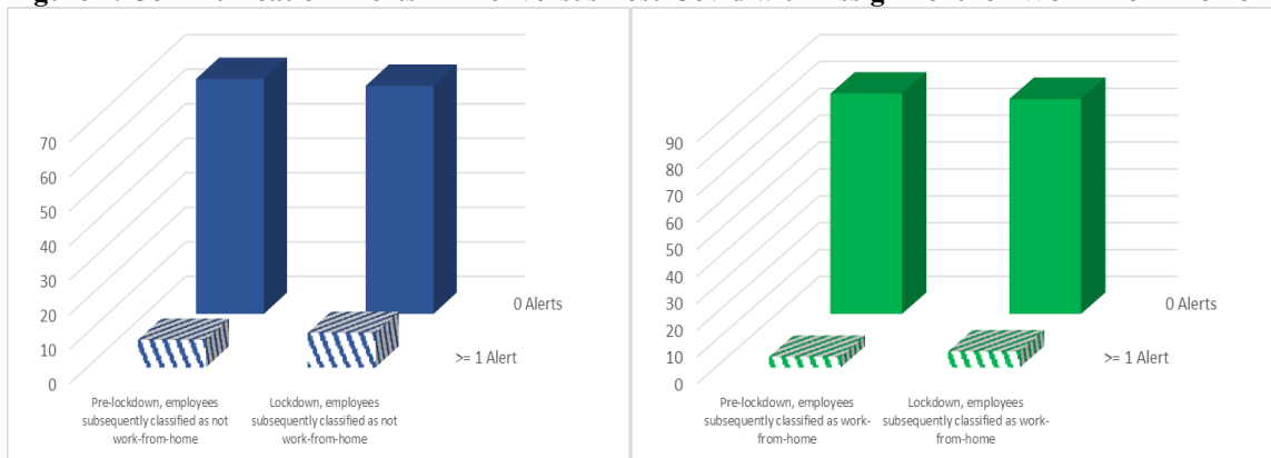
Panel A. Assigned to not work-from-home post Covid