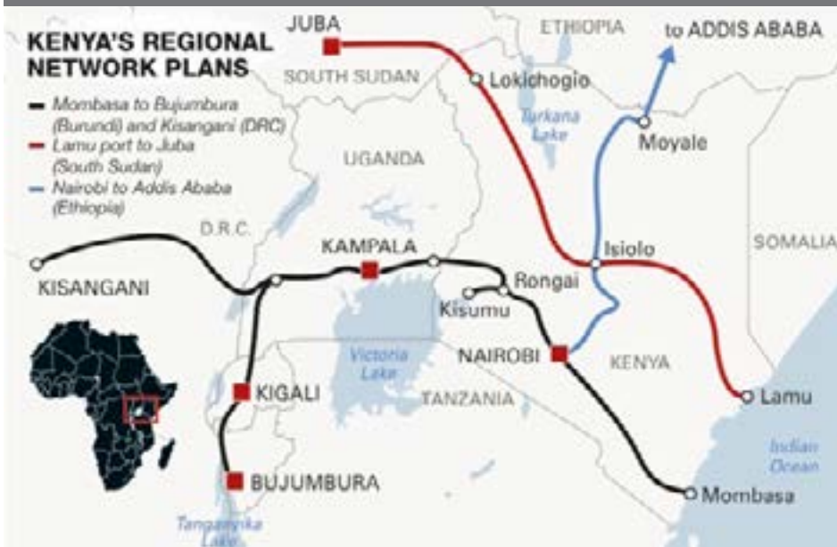
Figure 1: Map of the SGR 9

However, in the spring of 2016, reports—subsequently denied—suggested that Rwanda would rather build an alternative railway through Tanzania that would link to a refurbished section of the TAZARA Railway. 12 Kenya was quick to announce a new plan of re-routing the railway to the Kenyan town of Kisumu on the shores of Lake Victoria rather than to the Kenya-Uganda border town of Malaba. 13 This announcement appeared to spite Uganda for canceling the agreement on an oil pipeline through Kenya just a month earlier. If confirmed, Rwanda and Uganda's exit poses a challenge for Kenya as the cost-benefit calculation for the two mega-projects—the SGR and the pipeline—will change dramatically.