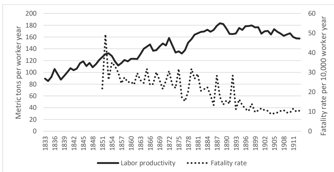
Figure 2. Labor productivity and the fatality rate in coal mining, Belgium, 1833-1913