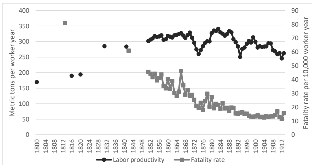
Figure 1. Labor productivity and the fatality rate in coal mining, Great Britain, 1800-1913

Notes: Production includes coal extracted from open quarries. The records do not generally distinguish between bituminous and anthracite, but only small amounts of the latter were produced. The fatality rate for 1813 and 1842 refers to the North-East coalfield only.