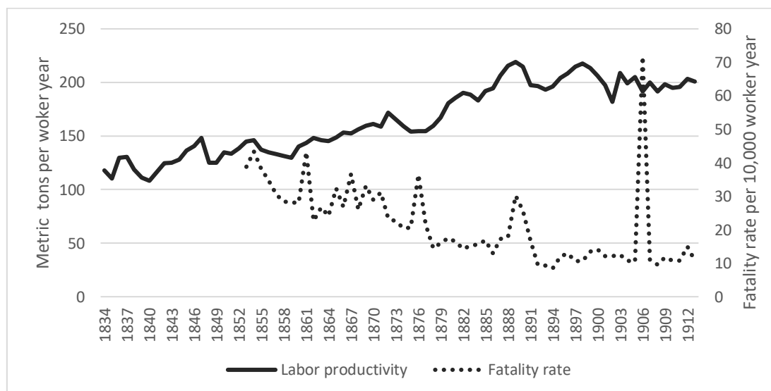
Figure 3. Labor productivity and the fatality rate in coal mining, France, 1834-1913