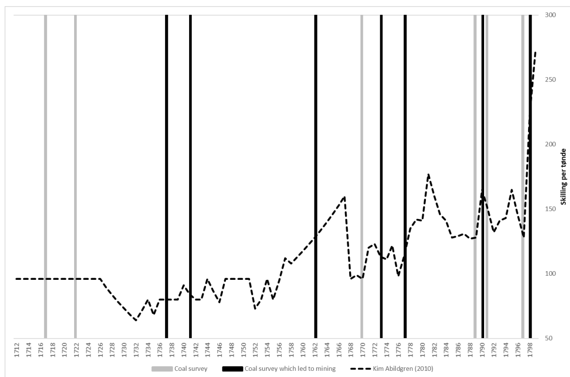
Figure 2: Coal surveys/mining start-up and prices