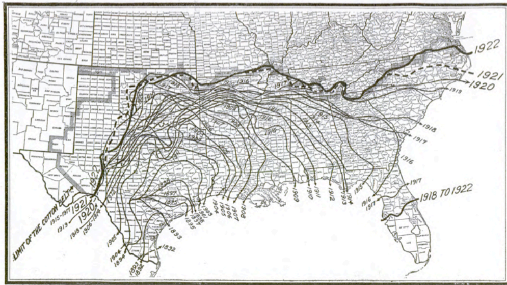
FIG. 1.—Map showing spread of the Mexican cotton boll weevil in the United States from 1892 to 1922, inclusive.

USDA Map of the Spread of the Boll Weevil, 1892-1922