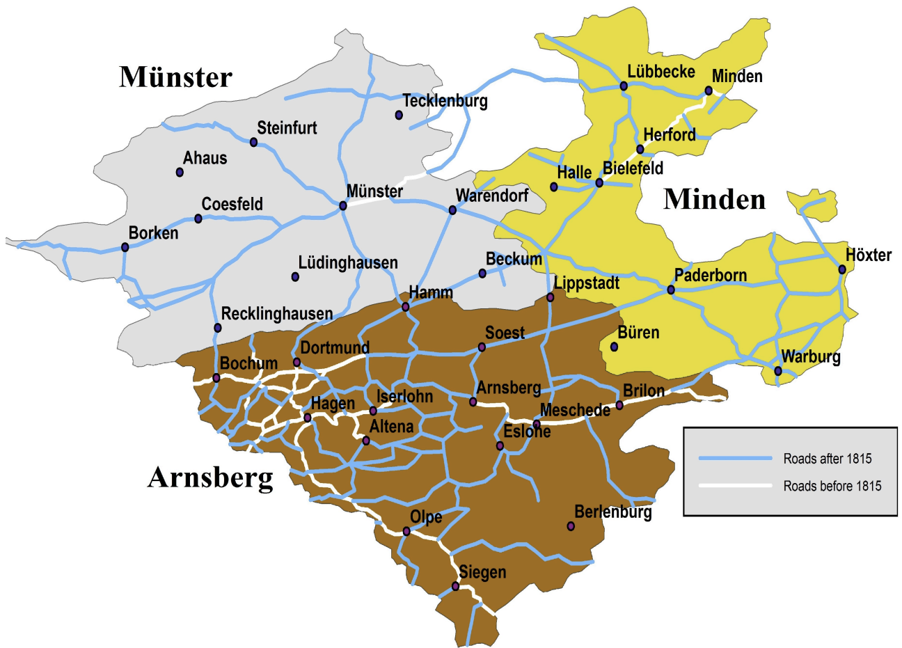
Figure 1A: Overview of the markets contained in the robustness data set