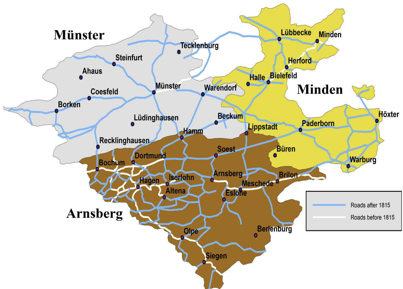
Figure 1A: Overview of the markets contained in the robustness data set