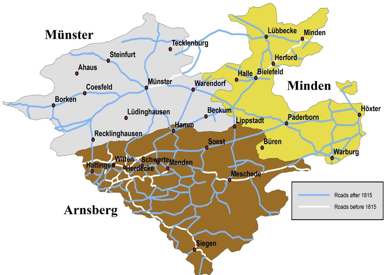
Figure 2: Paved road network during the first half of the 19 th century

Including data on waterways proved to be more simple, since their number and length did only slightly change during the first half of the 19 th century. They consisted of the navigable rivers Ruhr, Lippe, Vechte, Ems and Weser and the Max-Clemens canal. The Ruhr was undoubtedly the most important waterway in this region (located in the middle of the province and being a tributary of the Rhine). It was the most used waterway in Germany for trade in the 19th century because of the coalmines close to it. 37 Another important Westphalian waterway is the Lippe; a tributary of the Rhine as well located several kilometres to the north. The remaining waterways can be classified as secondary, since either they barely flow through Westphalian lands or they could not be travelled