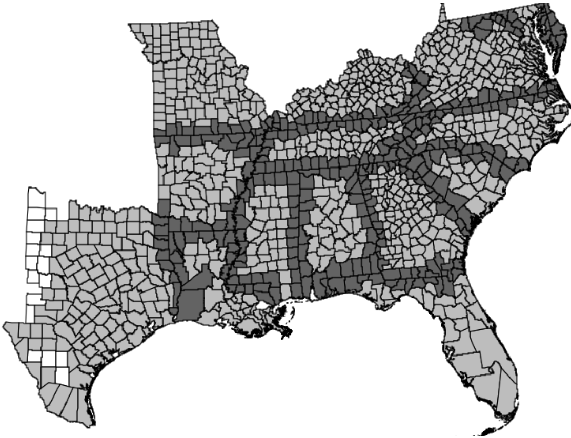
Figure 2: Border Counties in the US South 1860