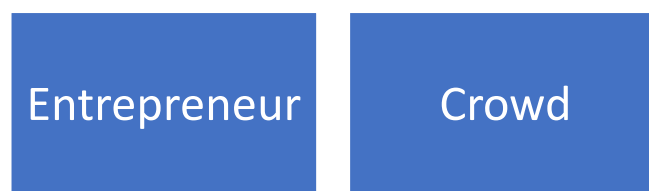
Figure 1. The pure ECF two-sided market

In the UK, this “pure” ECF model has evolved in several directions in response to issues that ECF throws up. Cumming et al. (2019b) document that Crowdcube offers voting A-shares to those investing at or above a monetary threshold such as £5k or £10k to attract potential professional investors to give campaigns traction, while the crowd receives non-voting B-shares. In other contexts, such as Germany, crowd investors are asked to pay higher prices if they receive more