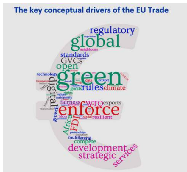
FIGURE 1: THE LATEST EU TRADE POLICY REVIEW: MAIN KEYWORDS