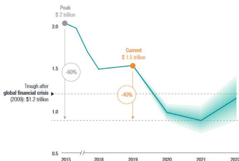
FIGURE 4: GLOBAL FDI INFLOWS: BEFORE AND AFTER THE COVID-19 PANDEMIC (USD TRILLIONS)