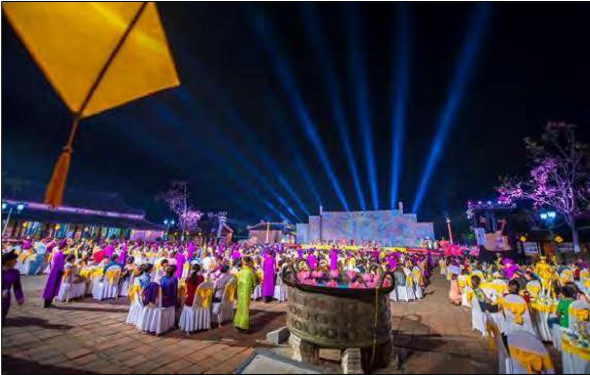
(Photo 1 – Ambience of a Royal Night in the Forbidden City inside the Citadel, Hue Festival Center, 2018)