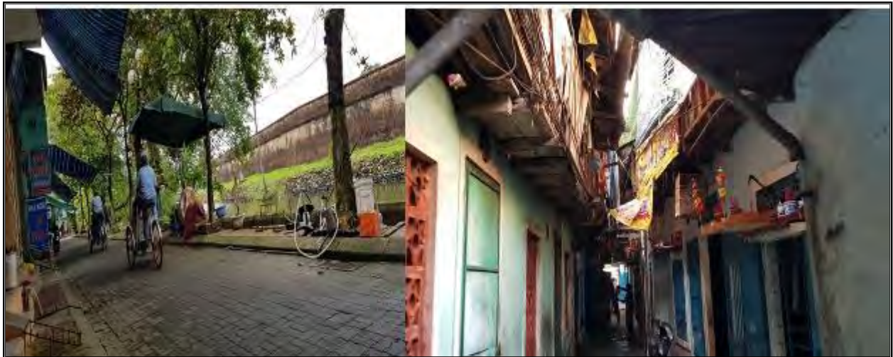
Figure 6. Two faces of a street

Two pictures were taken on the same street, Tran Huy Lieu Street, right outside the Citadel Wall (Figure 6). The left one shows the better half where households had been reallocated providing a clear lane with the view to the Wall and the front canal. Tourists sometimes take this lane to enjoy the Citadel on cycles. The right picture shows the other half of the street, where many households living poorly and crowdedly, we cannot see the Wall and the water line on this side.