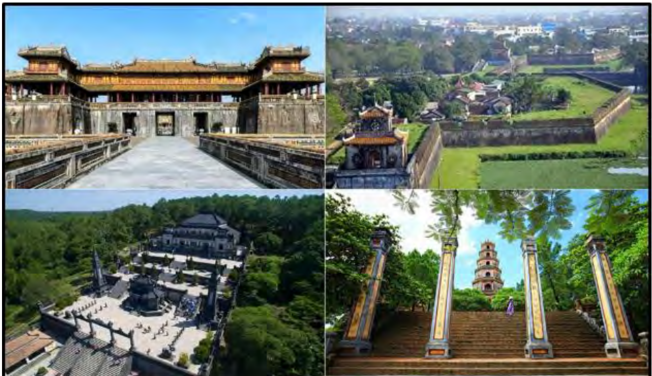
Figure 2. Components of the Hue Complex

(Photo from left to right: 1) Main gate to the Imperial Citadel 2) The Citadel Wall 3) Khai Dinh Tombs 4) Thien Mu Pagoda