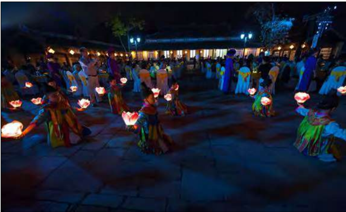
(Photo 2 – Royal artists in traditional performance costumes, Hue Festival Center, 2018)