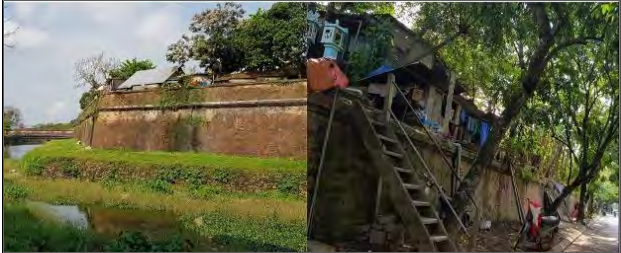
Figure 5. Households living on the outer Wall (Thượng Thành) of the Citadel

Over time, the number of people living on the Wall is growing which generates enormous pressures on the conditions of the heritage components (Figure 5). While the HMCC continues to emphasize the need to reallocate the people in order to conserve the WHS, little progress has been made.