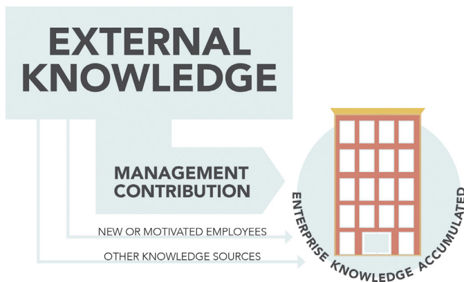
Fig. 2. Entrance of knowledge into an SME. Proposing that lean thinking is accumulated and retained predominantly at the management level.

Staff attrition worsens the situation for SMEs. Employee training develops internal capabilities, but they can quickly move on to opportunities in larger firms [10]. In addition to the attrition of general knowledge, their experience within the particular organisation is lost. This kind of tacit understanding takes much time to develop and is difficult to codify for others to reference. Lean systems develop to suit the operating characteristics and culture of an organisation. The extent of documentation required to document such tacit knowledge is enormous and difficult to achieve in the constraints of a small business, however also potentially devastating to enterprise efficacy if it leaves with a staff member. Hence, in an SME it is particularly important for management to own the profound lean knowledge for continued success.