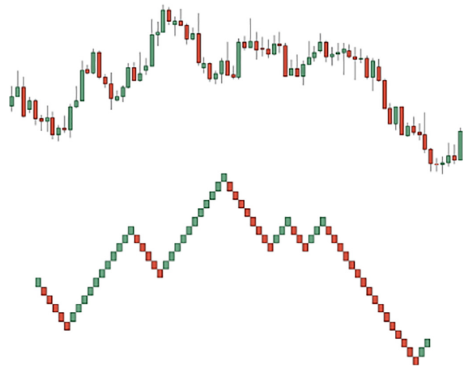
Fig. 1. The transformation of normal candlestick chart into a renko chart with 10 pips bricks based on closed price.

According to the Renko bars trading tool the common candlestick chart is transformed into a chart where the bars are formed based on the range that the security covers, independent of the time. Renko charts use price “bricks” that represent a fixed price move. As it is seen in Fig. 1, the new chart is formed up or down in 45° lines with one brick per vertical column. For example, in a