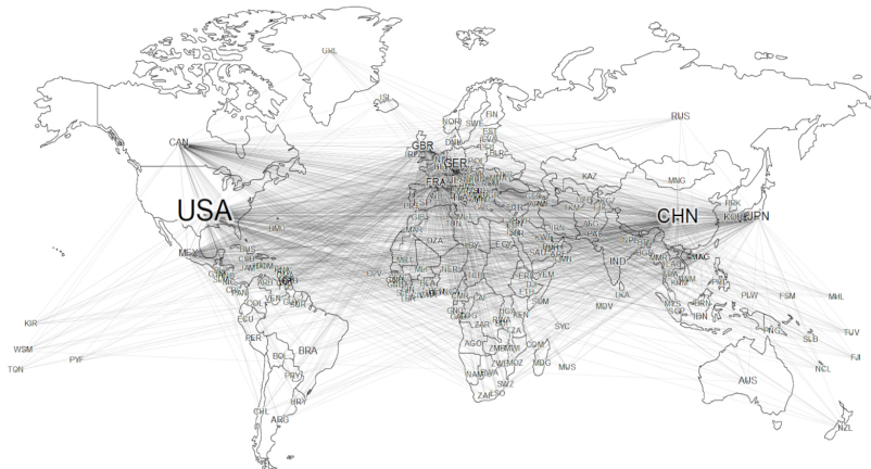
Figure 1: World-trade discrete network in 2015

in-degree and out-degree of any given country, where the former reflects its imports and the latter its exports. Since both perspectives yield an equivalent representation of the network, 9 we choose the import-based one and define simply the degree of a country as the number of other countries from which it receives its imports.