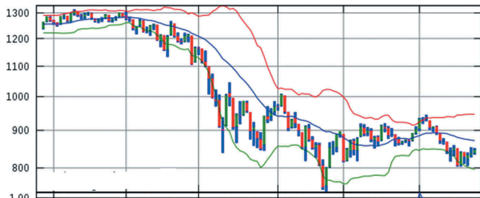
Table 5. Bollinger Bands-Based Trading Strategy Results