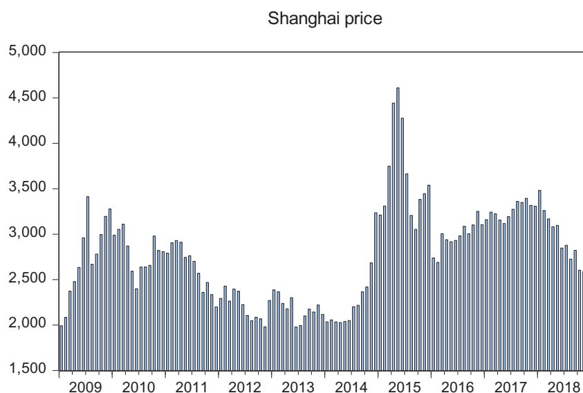
Figure 1 represents the stock price volatility for Chinese market over the years. Y-axis represents the time-period and X-axis represents the price.

These actualities are additionally settled by the ADF test, which is an appropriate and legitimate testing system for deciding the stationary or non-stationary nature of the information outline.