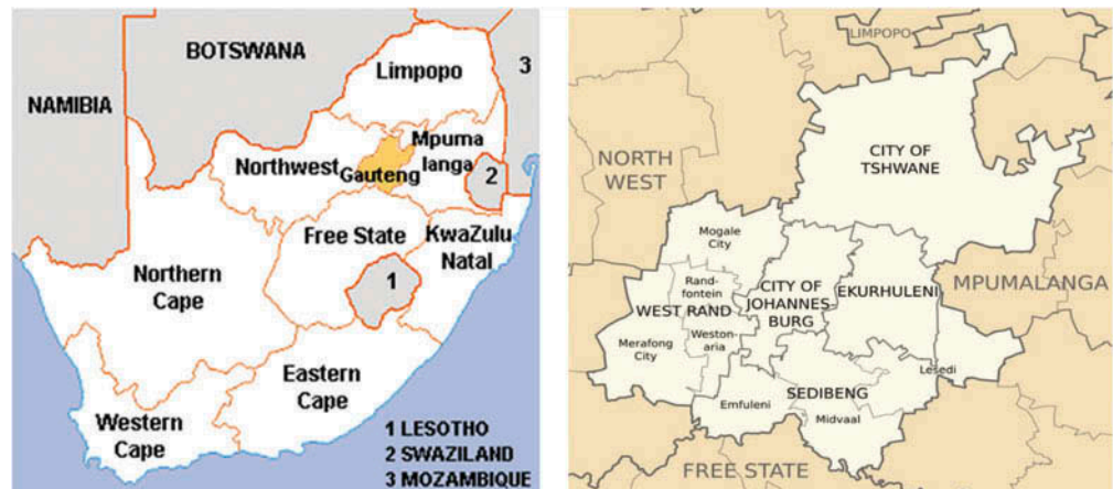
Figure 1. Map of the Gauteng province and its municipal borders.