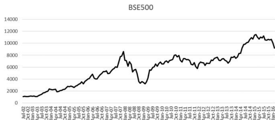
Figure 1. BSE 500 index during the study period.

All the variables are tested for stationarity using Unit root tests. Then, we check for cointegration that looks for a long run equilibrium relation towards which the selected time series tend to revert.