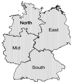
Figure 1: Four German Macro Regions

In order to give some descriptive evidence regarding differences in spatial job matching patterns by skill level and type of job change, I consider job matching between four macro-regions (north, mid, south, east) as shown in Fig. 1.