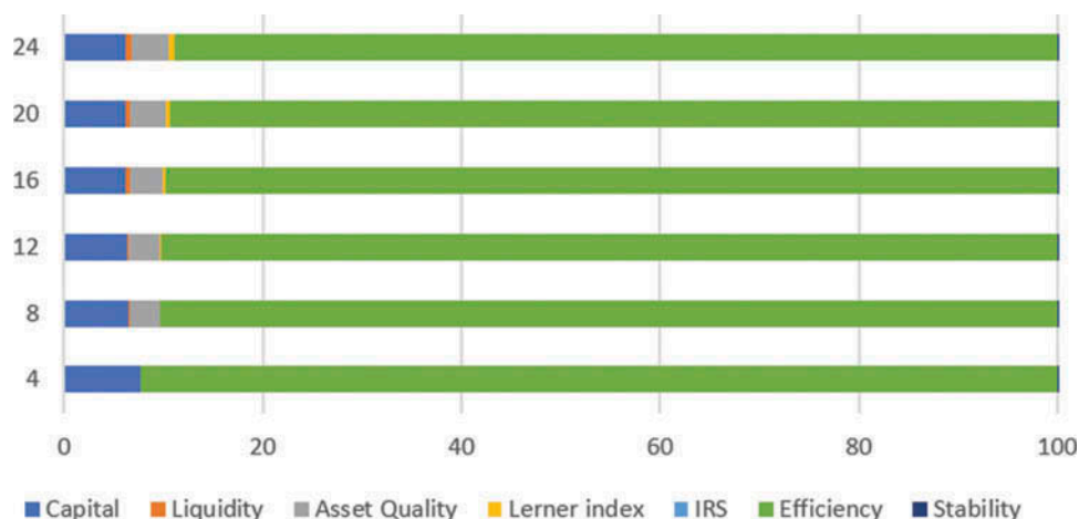
Table 4. Variance decomposition of efficiency