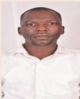
Moses Kisame Kisubi

Abstract: To determine the moderating effect of entrepreneurial self-efficacy (ESE) in the relationship between entrepreneurship education (EE) and self-employment intentions (SEI). Explanatory survey design together with systematic sampling technique were utilized to collect data from a sample of 458 undergraduate finalists from Makerere and Kyambogo Universities in Uganda. Data were analyzed using Hayes' PROCESS macro vs3.2 (Model 4). Results of the study indicate that entrepreneurship education and entrepreneurial self-efficacy are significant predictors of students' self-employment intentions. The study also found a buffering moderating effect of entrepreneurial self-efficacy significantly in the relationship between entrepreneurship education and self-employment intentions. The study contributes to the extant literature by confirming the relationship between the study variables and supporting both SCT and TPB. Besides, the study provides new insights concerning the moderating role of ESE in the relationship between EE and SEI. Educators, curriculum developers, and university management need to conduct a students' entrepreneurial competence needs assessment before, such that the entrepreneurial course is customized to the needs of the students other than a generalized and standardized entrepreneurial course. The study provides new insights