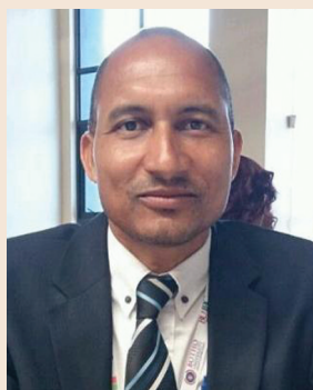
Tendai Douglas Svotwa

Abstract: The study explores the nexus of relationship between Black Friday rituals, customer value and customer loyalty among young adult customers in South Africa. A descriptive research design was followed and data were collected from 400 young adult customers aged 18–35 in the Gauteng province of South Africa through self-administered questionnaires. Furthermore, the measurement and structural models were assessed using Amos 23.0. Relational capital and social influence significantly and positively influence customer-perceived value, while customer-perceived value significantly and positively influences the customer loyalty of young adult customers towards Black Friday rituals. The testing of the proposed model validates the relationships that are hypothesised between the independent variables (cognitive capital, relational capital, social identification, social influence, social convenience), customer-perceived value and customer loyalty of young adult customers. The findings assist retailers in understanding how relational capital and social influence