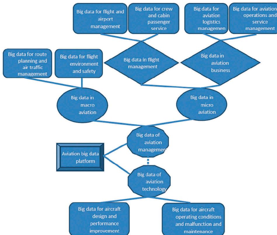
Figure 1. Aviation big data platform and information system.

management, is directly related to the normal flight and safety of flights. As the limitations of traditional manual management modes are increasingly prominent, so the role of big data is becoming more and more prominent.