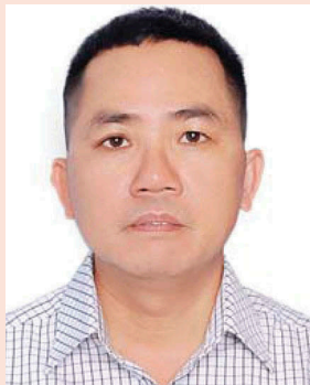
Nguyen Thanh Hung

Abstract: Government quality, economic growth and income inequality are topics that are of interest to many researchers, especially in Vietnam—a country with high economic growth and income inequality, and the quality of government is not fully transparent. Moreover, these three topics are only experimentally conducted separately and have not been explored simultaneously. This study analyzed the concurrent relationship between government quality, economic growth and income inequality within Vietnam in the period 2006–2017 with Stata tool with 3-stage regression model. The results show that higher government quality will boost economic growth and reduce inequality among provinces. On the other hand, economic growth can improve government quality but increase income inequality among provinces. This implies that the government and public administration executives will have a full perspective to assess and predict macro policies and make reference for further studies.