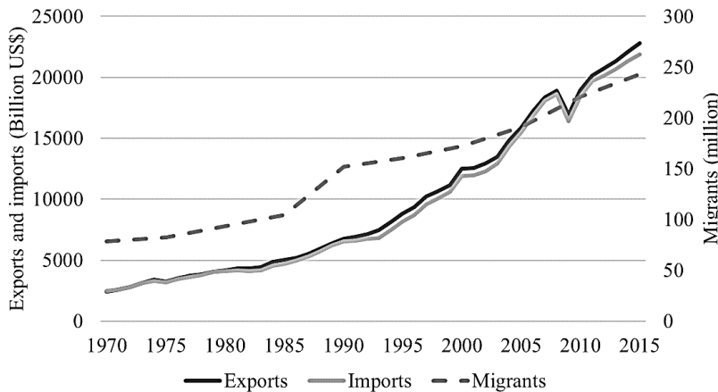
Figure 1. International Trade and International Migrants, 1970-2015

Notes: Trade values stated in constant 2010 US$. Exports and imports include trade in goods and services. Source: World Bank (2017).