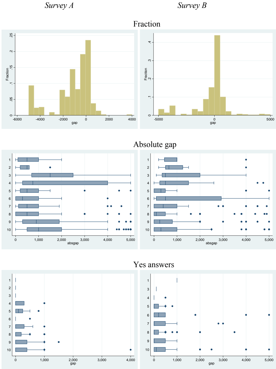
Figure 1. Fraction of the gap variable and a gap variable-certainty box plot