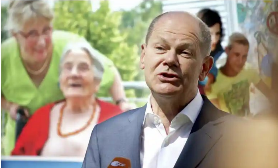
▲ German finance minister Olaf Scholz welcomed the agreement struck late on Tuesday.

Companies with revenues above €750m will be required to publish a country by country breakdown