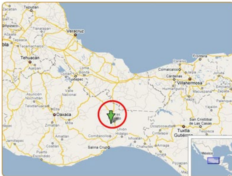
Figure 2: Location of La Venta