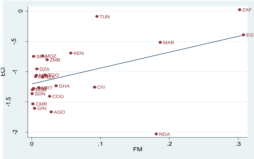
Figure 2: Financial markets and ECI