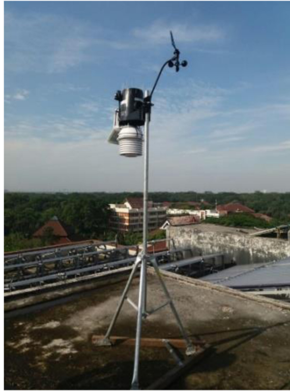
Fig. 1. Weather station.