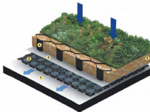
Fig. 2. Typical extensive green roof system. (1) Waterproofing membrane (2) Drainage system (3) Filter fabric (4) Cellular confinement cells (5) Lightweight growing medium [3].

There are lots of buildings which are old and low rise that do not have green roofs. Green roofs on low-rise buildings give more benefits than on the tall buildings, hence a low-rise building was selected for this study. In this study, environmental impacts of both types of green roofs are compared with the non-green roof system. The life cycle of the green roofs was set to 25 years. The major objectives were to evaluate and quantify the environmental