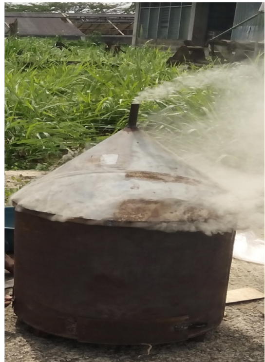
Plate 2.1. Charcoal kiln or carbonizer.

The carbonized granules were prepared by wet granulation method, this is a method of size enlargement in which fine powder particles are agglomerated or brought together into a larger, strong and relatively permanent structure called granules. Three types of binders, viz, cassava starch, corn starch and gelatine at three different concentrations of 10, 20 and 30% w/w were used to produce the carbonized briquettes. With 150 ml of distilled water, the binder was mixed and allowed to dissolve without any clogs or lumps; the binder solution was heated in a water bath at 100 °C for 10 min with continuous stirring until a whole paste was formed. An appropriate amount of carbonized corncob powder was weighed and thoroughly mixed manually with the prepared binder solution to obtain a homogeneous damp (wet) mass. The wet mass was sieved with a mesh number 12 to obtain wet coarse aggregate granules and dried in the oven at 60 °C. The dried granular mass was milled using a bur mill to breakdown the dried coarse aggregate then passed through a mesh number 16 to obtain uniform sized fine granules that was used for the production of the briquettes; Ngwuluka et al. (2010) stated that this process enhances adhesion and production of identical briquettes.