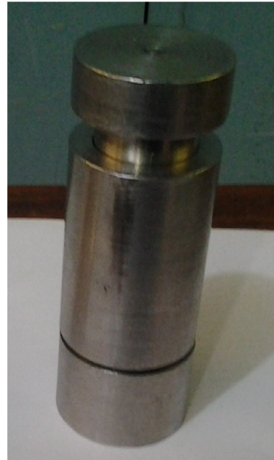
Plate 2.4. Punch and die (Manual briquetting machine).