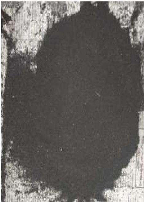
Plate 2.3. Carbonized corncob powder.