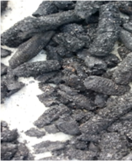
Plate 2.2. Charcoal kiln or carbonizer.