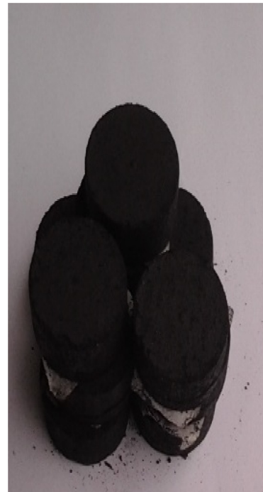
Plate 2.5. Carbonized corncob briquettes.

the briquettes production (Plate 2.4). This punch and die method was operated by a hand-powered hydraulic press to compress the granules to achieve briquettes of uniform shape. Ten grams of the granules was weighed using a digital balance, Model PM 4600. This was put in the die for each experiment carried out. The samples were compressed at the predetermined compacting pressure levels using Hydraulic Press Hyspin AWS 22/32 compression machine. For all the press made, the dwelling time for each press was maintained at 120 s to achieve a stable briquette in agreement with Oladeji and Enweremadu (2012) . Plate 2.5 shows the carbonized briquette produced.