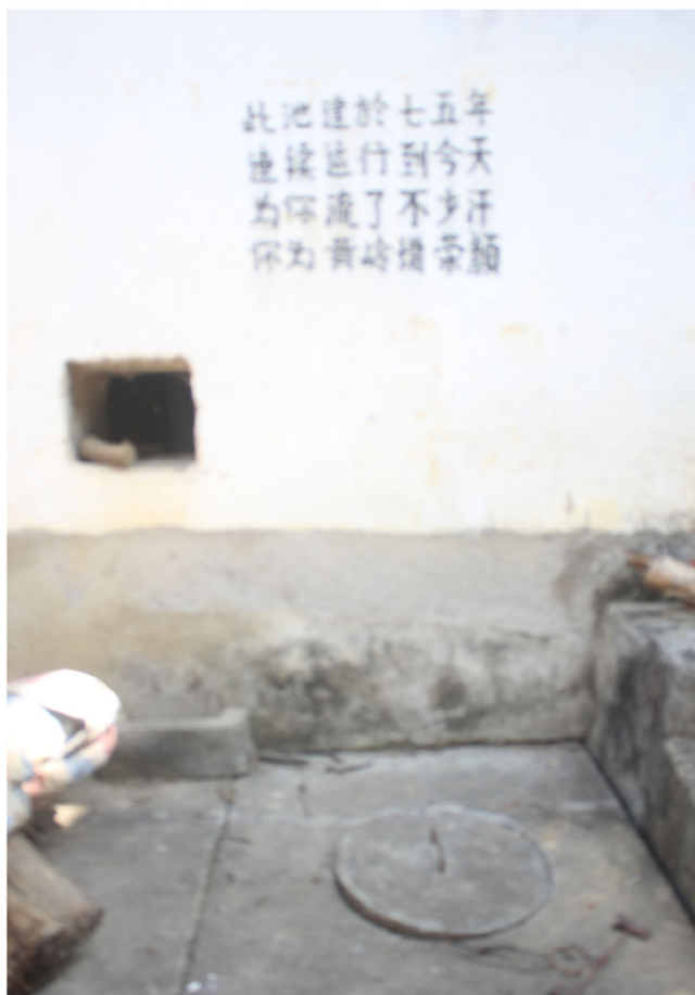
Fig. 1. The first marsh gas tank built in 1975.

Although marsh gas can efficiently utilize in countryside in China, in the existed literature about countryside energy in China, marsh gas is neglected. Especially, there lacks theoretical support for marsh gas development for remote countryside. It is important to develop policies to support marsh gas in countryside to solve energy issue. This article aims to analyze the marsh gas policy of countryside in China.