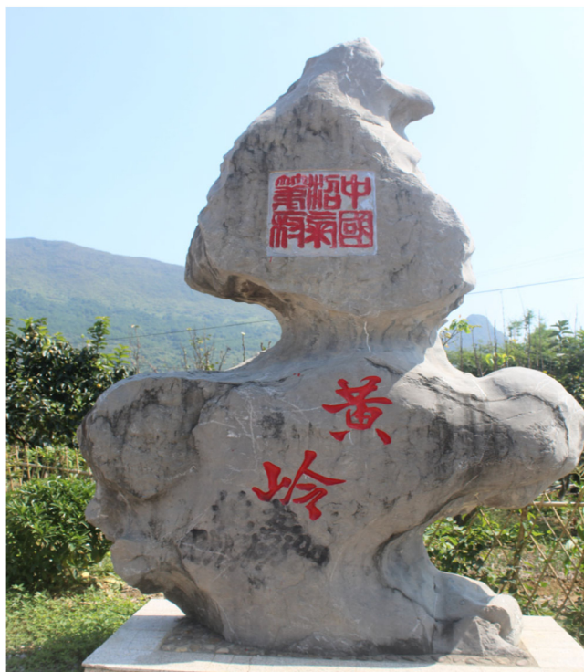
Fig. 2. First Village of marsh gas in China.