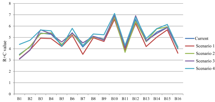
Fig. 2. Sensitivity analysis of R_i + C_j values.