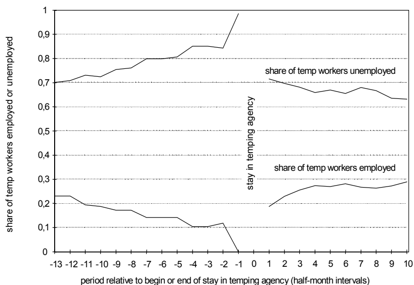
Figure 2: Employment status of TWs before and after their stay in NPTA