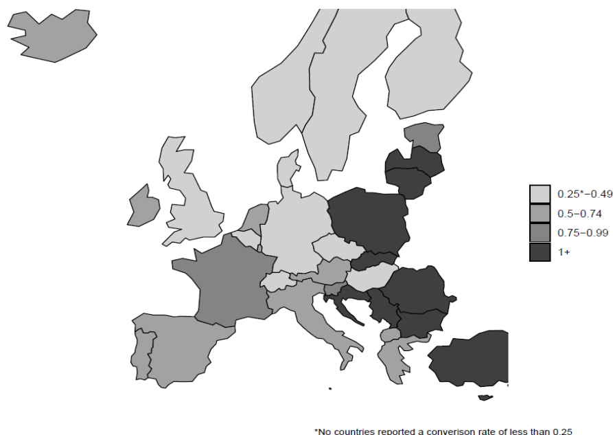
Figure 1. W/M Conversion Rate for Economics Graduates across Europe, 2015-2018 4

Next, we aim to compare economics with its closest alternative, business studies, 5 and STEM, 6 a group of degrees with an even more historically pronounced underrepresentation of women. 7