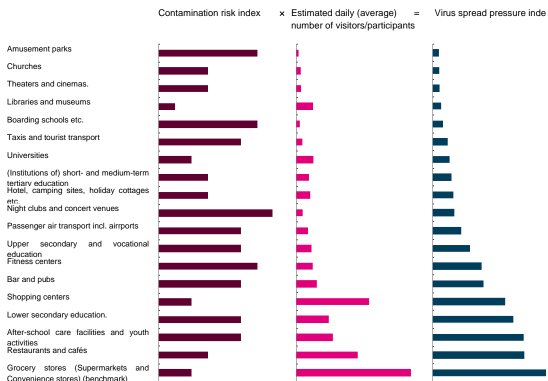
Figure 1: Assessment of contamination risks across sectors