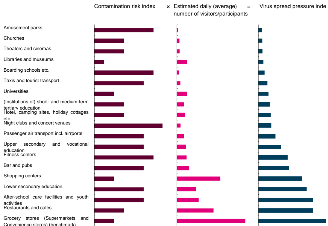
Figure 1: Assessment of contamination risks across sectors

Source: Statens Serum Institut SSI (contamination riskindex), Statistics Denmark, and own calculations.