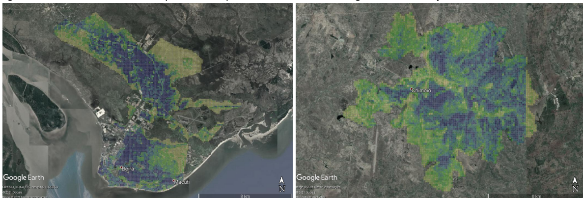
Figure 2: Beira and Chimoio decomposed into squares with colours indicating structure density

Note: darker blue cells indicate areas with a higher density of buildings