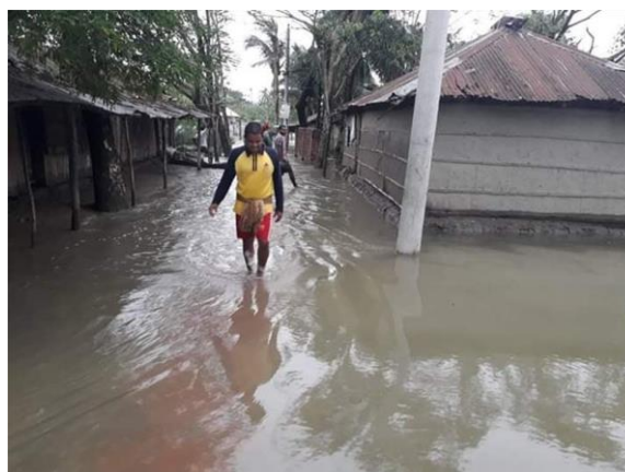
Figure 2(b). Inundated homestead area, Koyra (May, 2020)