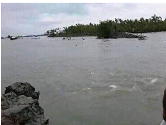
Figure 2(a). Broken Embankment, Koyra (May, 2020)