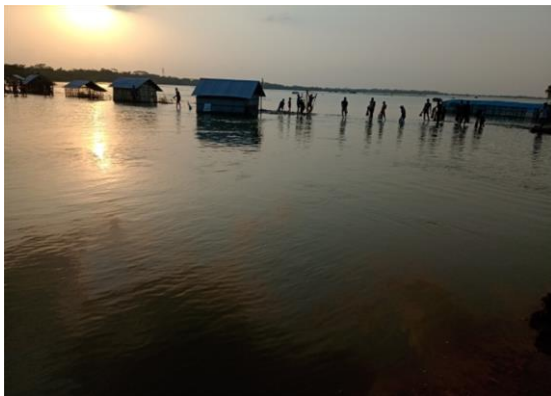
Figure 6 (b) Inundated shrimp gher in Koyra (Khan May 2020)

The key informants said that both the brackish water shrimp and freshwater are cultured in the saline coastal Bangladesh. The farm enterprise is a source of cash income of farm households and generating employment for wage workers, in particular in Koyra of Khulna, Shyamnagar and Ashashuni of Satkhira and Morrelganj and Kachua of Bagherhat. Besides, cropping high-value cash crops, i.e., vegetables on the dike of gher of freshwater prawn is also a source of cash income and nutrients for the dwellers.