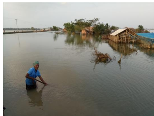
Figure 6 (b) Inundated shrimp gher in Koyra (Khan May 2020)