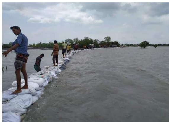
Figure 2(d). Village dweller reconstructed Embankment, Koyra (June, 2020)