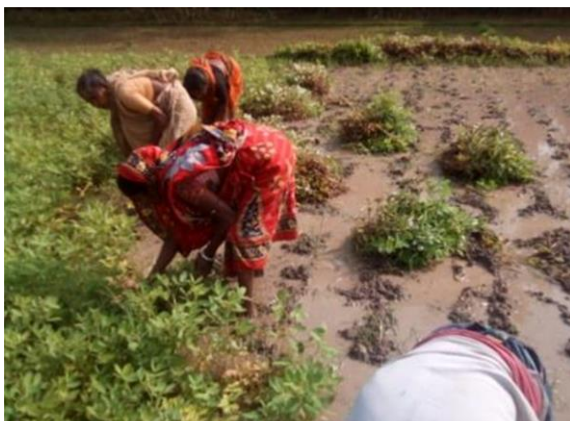
Figure 5(a). Farmers harvested immature groundnut due to water stagnated in the fields in Morrelganj (May 2020)

eggplant, mungbean, okra, groundnut, chillies, snake gourd, sponge gourd, ridge gourd, cucumber, watermelon, amaranths and pumpkin in the range between 5-10 decimal. They said that the non-rice crops are a source of family nutrient and cash income for investing in the farm and paying family expenses, including the cost of education for the children. However, the performance of the rainfed non-rice crops substantially varied due to seasonal weather variation. For instance, the rainfed non-rice crops gave a good harvest if there is some rain in late March and late April. The yield of the non-rice crop notably decreased due to moisture stress because of drought or mostly damaged by heavy rain. The respondents reported that the Amphan not only largely damaged the non-rice crops in the current year in most case study villages but also it will hamper the production of non-rice crops in some case study villages in particular in Koyra and Shyamnagar in the next 5-7 years due to increasing soil salinity because of inundation of arable lands with tidal saline water for about a month (Figure 5). It was observed that total loss per household for damaging the first and second most dominant non-rice dry season crops was in the range between BDT 9,000 - 30,00 (Table 10 and 11).