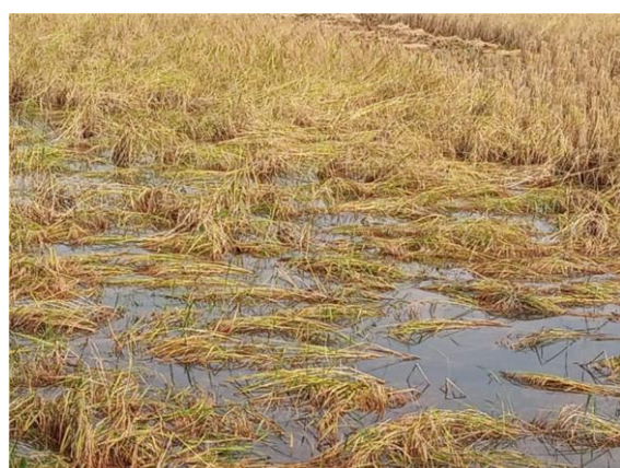
Figure 4 (a). Submerged boro rice, Morrelganj (May, 2020)