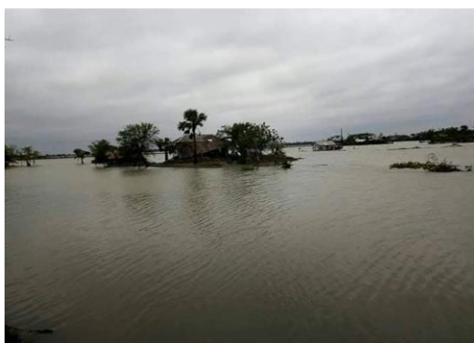
Figure 3 (a). Inundated arable areas in Koyra, Khulna (May, 2020)

The key informants said that arable areas of most case study villages inundated with 3-5 feet of water because of admitting tidal saline water through (i) breaking the Embankment or (ii) over the Embankment. Besides, arable areas in some villages flooded by the heavy rain due to depression in the Bay of Bengal (Figure 2 and Figure 3).