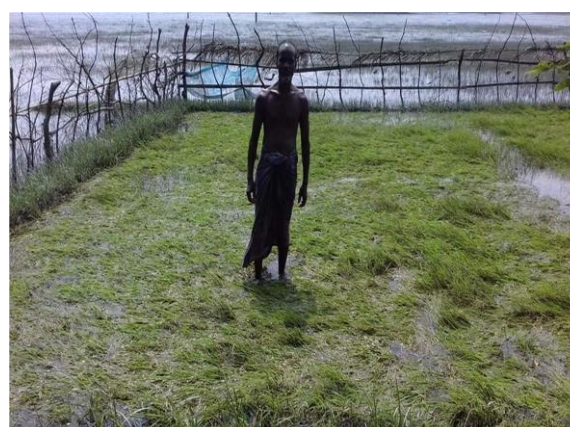
Figure 4 (a). Submerged Aus nursery, Morrelganj (May, 2020)