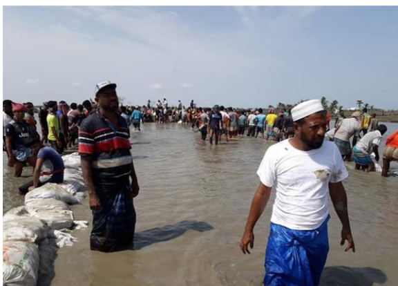
Figure 2(c). Village dweller are reconstructing Embankment, Koyra (May, 2020)