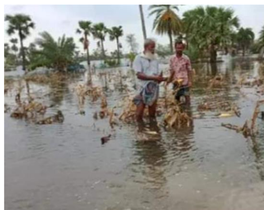
Figure 5 (b). Damaged maize due to water stagnated in the fields in Koyra (May, 2020)