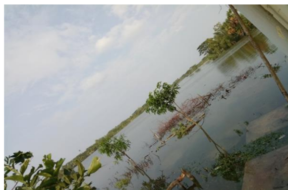
Figure 3 (b). Inundated arable areas in Kashmiri, Shamnagar (May, 2020)