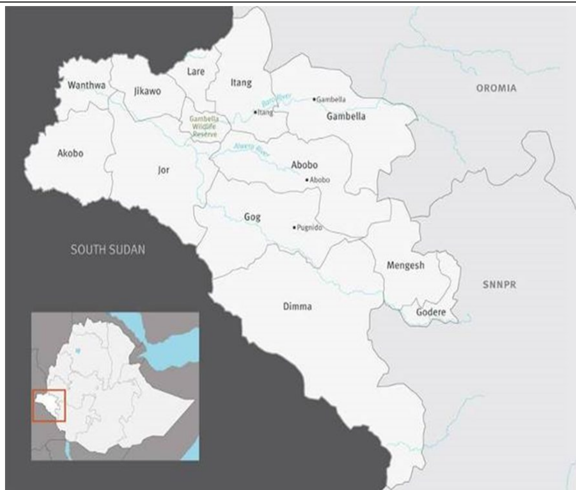
Figure 1: Map of the Gambella People's Regional State