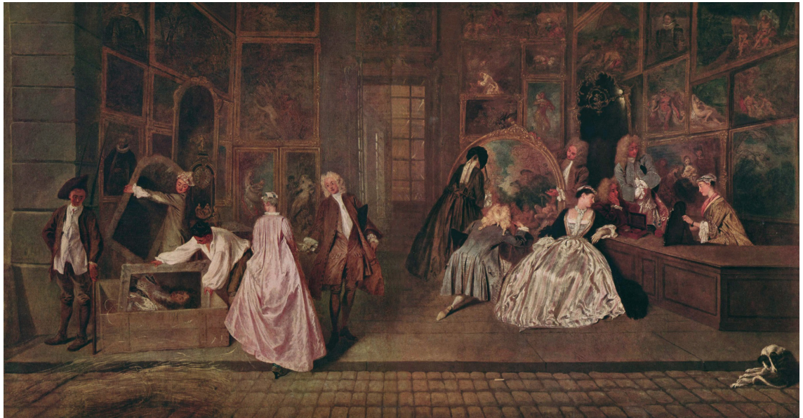
Antoine Watteau, L'Enseigne de Gersaint , 1720/21, today in Schloss Charlottenburg, Berlin.

The three works represent salerooms in art markets that operated roughly one hundred years apart: 1720, 1890 and 2018. Altman's film connects two stages, 1890 and 1987. In section 1, I describe each of the three artworks, with a focus on the social treatment after their creation. In section 2, I interpret them, focusing on their valorization through the device of a saleroom and on the valuation of their singular artistic invention.