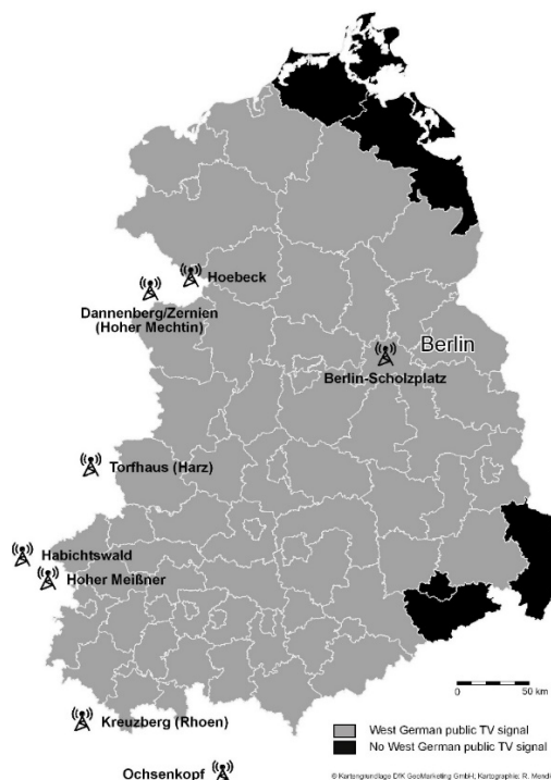
Figure 1: East German regions with and without West German public TV signal