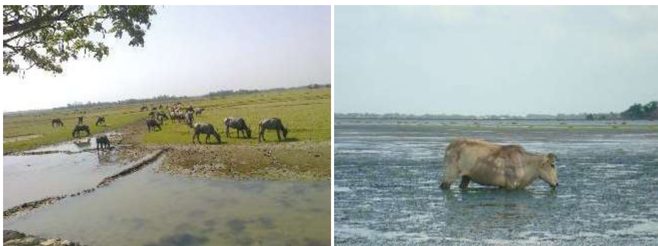
Fig. 2 No feed for livestock; the cow is grazing on algae in the gher .

Saline water brought into gher areas for bagda farming in Tildunga Union has also resulted in a reduction in land for livestock grazing, limiting opportunities for livestock production among farmers in the area. The shrinkage of paddy area associated with expansion of bagda farming has also led to an acute shortage of rice straw, which resulted in negative impacts on the livelihoods of poorer families dependent on cattle rearing.