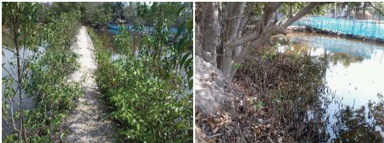
Fig. 1. Development of mangrove trees in bagda ghers .

in contrast to the considerable development of indigenous trees in Pankhali Union. Reduction of indigenous trees and dominance of mangrove trees provides an indication of the impact of salinity on forestry. Mangrove trees (namely 'Gewa' - Excoecaria agallocha and 'Golpata' - Nypa fruticans ) were notably more abundant in the Bagda gher areas.