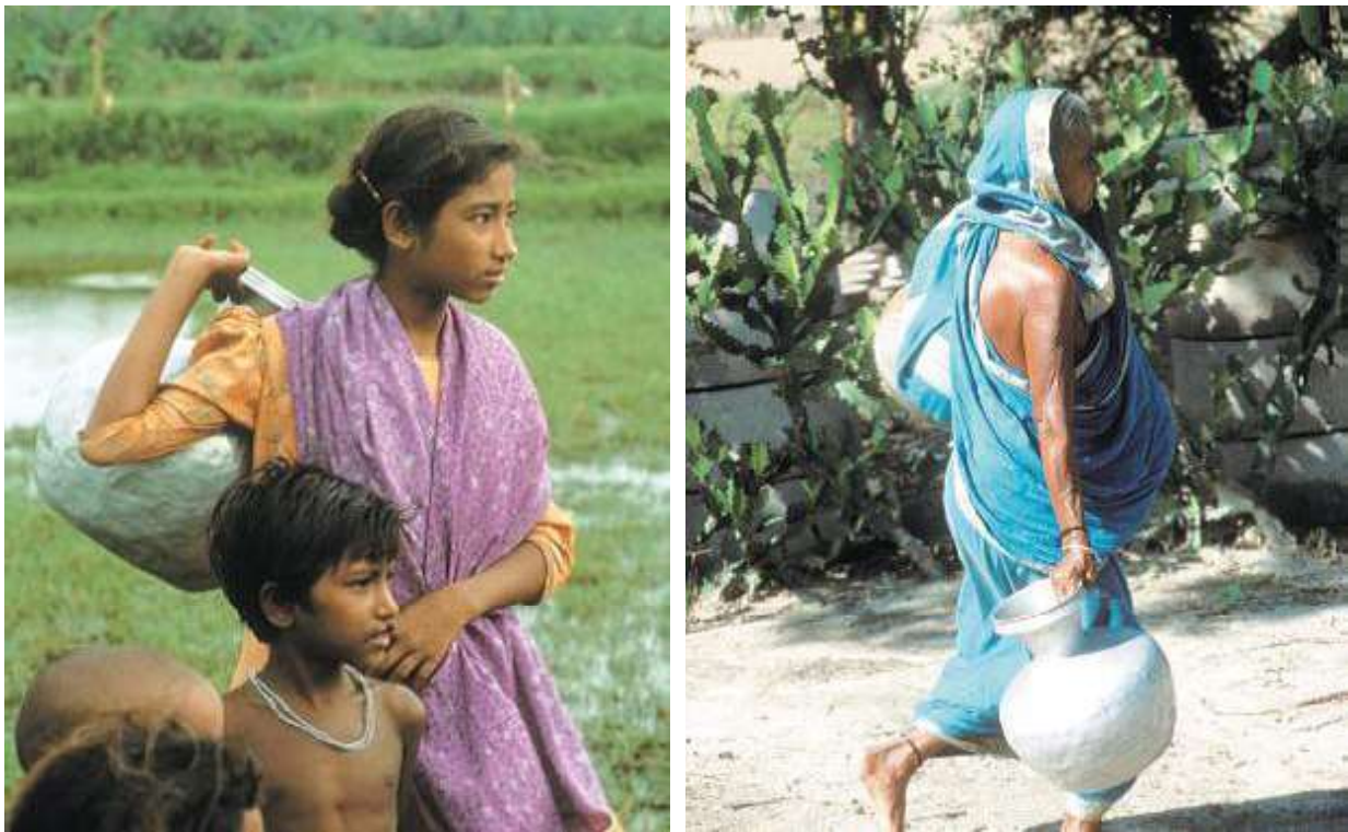
Fig. 3. Women and children have been the greatest victims of bagda culture developments.

People of Tildunga Union area generally drink pond water that is also used for other homestead activities. Bagda cultivation has led to flooding of the area with saline water and contamination of pond water with salt. Local farmers have tried to resist construction of bagda ponds near freshwater ponds, leading to social tensions and clashes in Tildunga Union. Poorer people in particular faced acute problems with access to drinking water, with rainwater becoming the only source of water for drinking and other domestic uses. Depletion and salinization of freshwater supplies means women and children have to walk increasingly long distances to collect clean water.